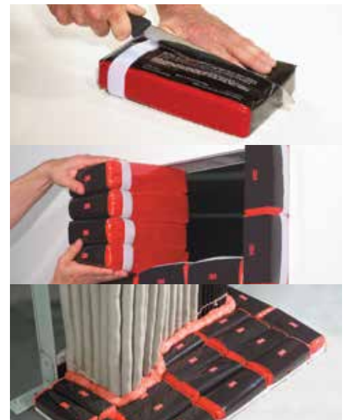
Multiple pillow sizes and ability to field-cut allow for a secure fit in most openings (seal cut edges with polypropylene box sealing tape).

For local availability and pricing enquiries please contact 3M.