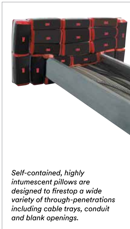
Self-contained, highly intumescent pillows are designed to firestop a wide variety of through-penetrations including cable trays, conduit and blank openings.